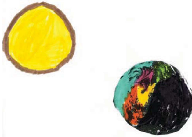
Figure 5. Relative positions of the sun and the earth: places facing the sun have day

Children drew or used collage in their representations of the phenomenon. In a large proportion of children’s work, the part of the earth that is not facing the sun is coloured black, whereas the one facing it is coloured with different bright colours (see Figures 5 and 6).