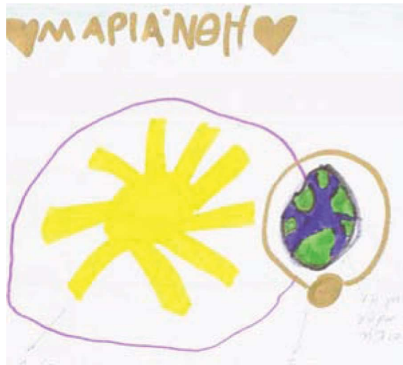
Figure 3. Sun, earth, and moon and the orbits of the last two

C: Because the sun moves in the sky. Slowly he goes higher and higher and then slowly he goes away.