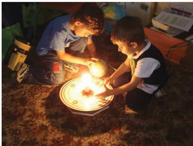
Figure 4. Investigating the phenomenon of day and night

Most of the groups presented and explained their findings in class. Below is one of the most accurate presentations: