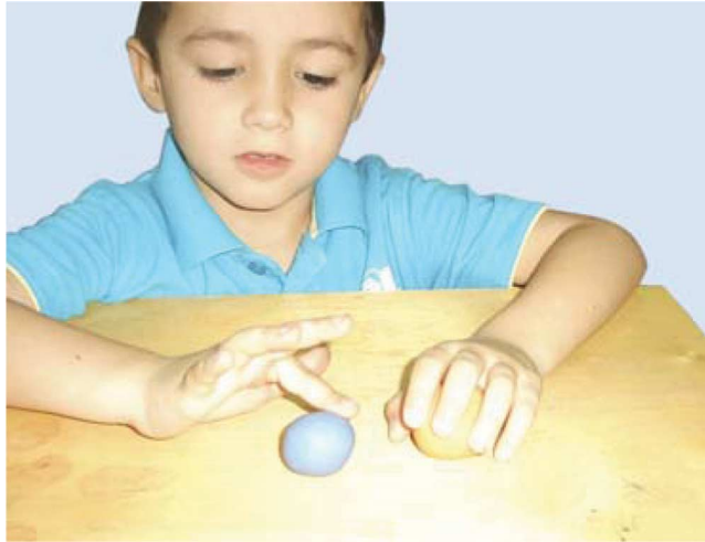
Figure 7. This boy used his middle finger to rotate the blue ball around itself while rolling it around the yellow one (sun) which he holds still

Some of the children wanted to show the movement of the moon as well: