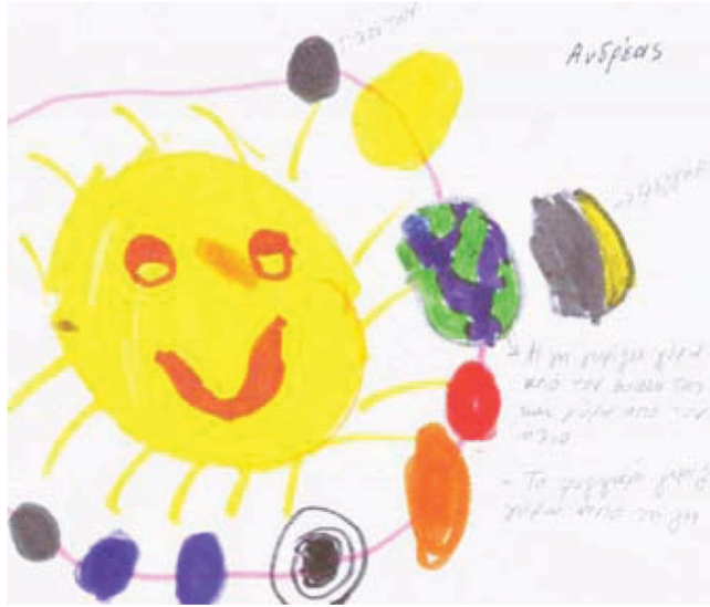
Figure 2. The solar system. The moon is placed next to the earth. The notes on the picture dictated by the child and written by the teacher read: “The earth rotates around itself and around the sun. The moon rotates around the earth”